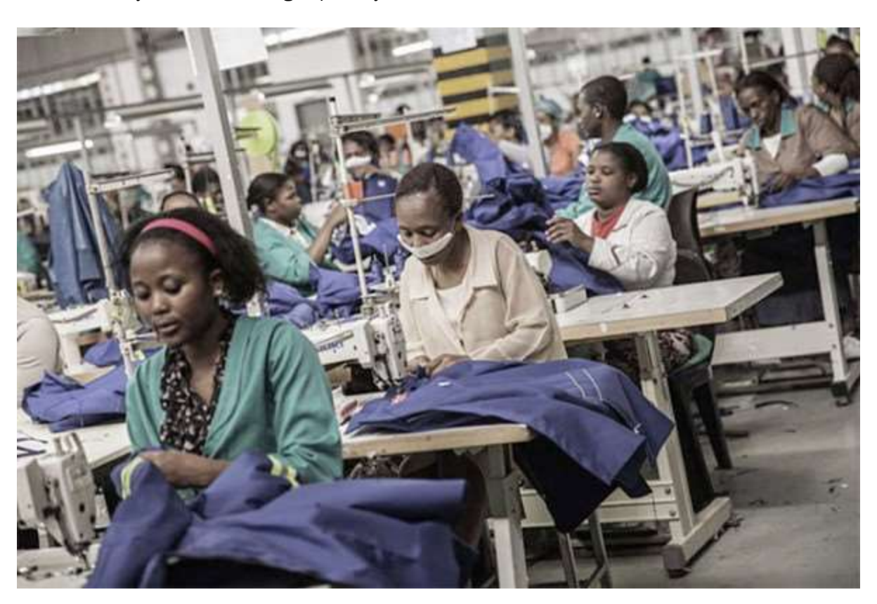
Fig 1: Apparel Manufacturing in Nigeria

Textile has the potential to alleviate poverty in Nigeria by creating employment opportunities, boosting economic development, and promoting local industries. Textile can indeed be a viable venture for poverty alleviation in Nigeria. Okon et el (2013) opine that poverty in the generic term is a social, economic and political deprivation. From the view point of United Nations Development Programmes UNDP (2000), poverty is a state of deprivation of basic necessities of life. Akerele (2007) as referenced by Ogunshina (2013) states that poverty is pronounced deprivation in well-being and comprises many dimensions which include low income and the inability to acquire the basic necessity and services necessary for survival with dignity. The country has a rich cultural heritage and a long history of textile production, which provides a solid foundation for developing the industry further. By promoting and investing in the textile sector, Nigeria can not only create employment opportunities but also generate income for many individuals living in poverty.