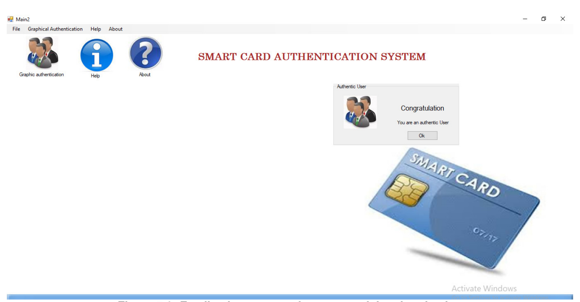
Figure 7.0: Feedback message after successful authentication

iv. Authentication Validation Message: This interface display a feed back after successful login into the system as shown in figure 7.0.