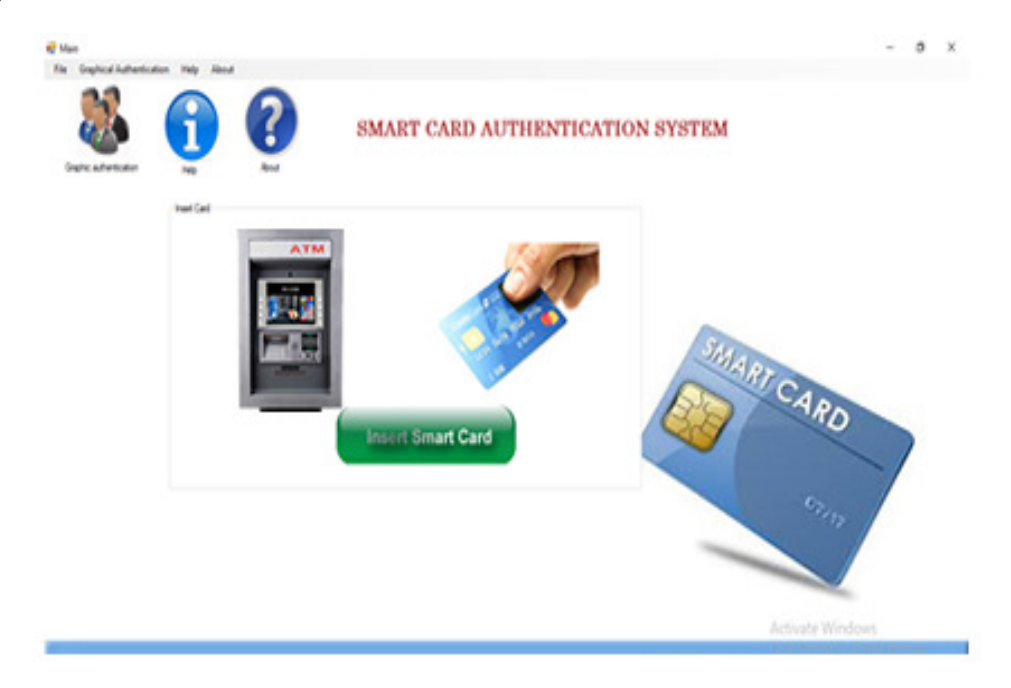
Figure 4.0: ATM smart card insertion process

i. Insert Card Form: As shown in figure 4.0, user proceed by inserting the ATM smart card into the card reader.