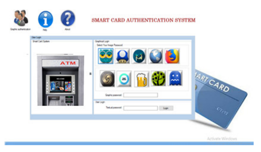
Figure 6.0: Graphical password scheme security interface for authentication into the system

iii. Graphical password : As shown in figure 6.0, user are to select four images for the next level authentication before having access to the ATM smart card information.