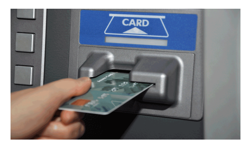
Figure 1.0: Typical Image of an ATM Smart Card

The usage of smartcard is actively growing over the last decade as they are many usage of them such as telecommunications (GSM), banking services and identity card. One of the most usage smart card today is ATM card. Even it is widely used, ATM card services is not considered secure 100% in order to protect the money in bank account [5]. To protect data during their transmission over insecure channel, adequate network security measures are needed to resist potential attacks from eavesdropping, unauthorized retrieval and intended modification, etc. For every business transaction authentication is required. It is the primary requirement before the user accesses the server over insecure channel as it prevents unauthorized access [8].