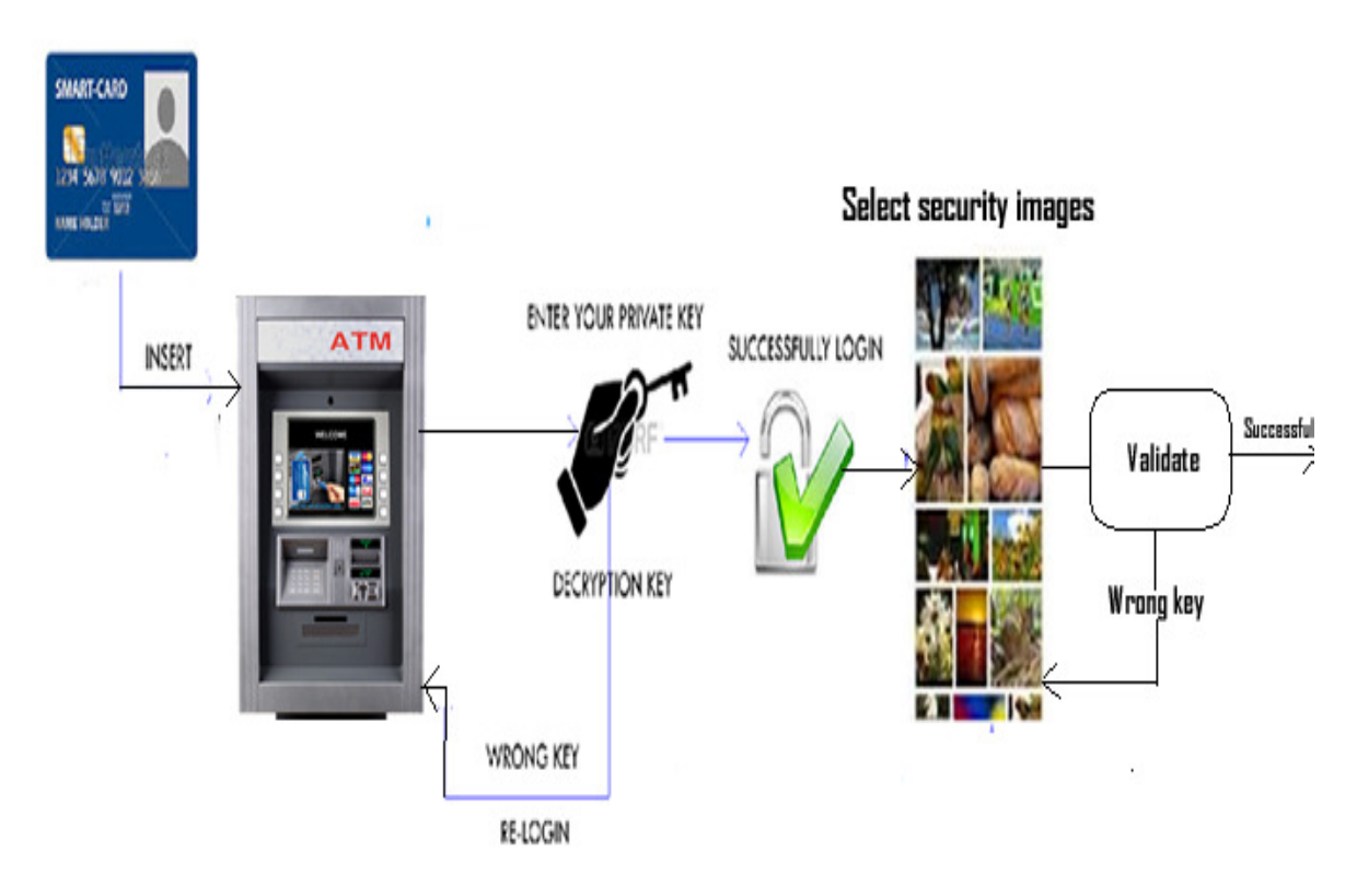
Figure 3.0: Architectural design of the proposed model

In order to overcome all the prior methods shortcomings, the objective of this paper is to propose a new algorithm based on the Recall-based scheme. The proposed model is to develop a Graphical Authentication System and a Text-based System of ATM Smart Card during Service Delivery. In this algorithm, users need enter their password then later tap their spots in their predetermined image in a sequence to be authenticated as shown in figure 3.0.