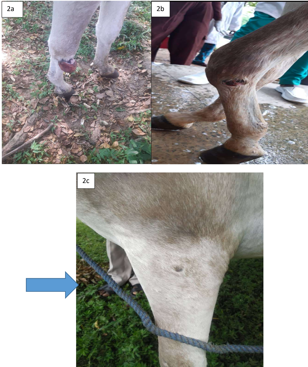
Fig 2(a-c): Picture showing reduction in sizes (atrophy) of all tissues.