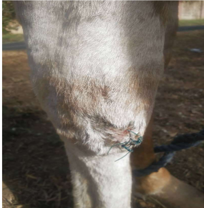
Figure 4: Site of wound after surgical excision.