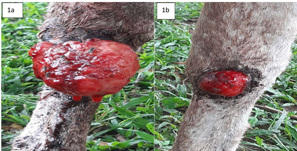
Fig 1(a-b): bilateral swollen masses around the knee joints.

Excisional biopsies from the wound were fixed in 10% neutral buffered formalin for histological processing, stained with Haematoxylin and counterstained with Eosin for microscopic examination. Histologically, there was abundant granulation tissue characterized by marked neovascularization (formation of new capillaries), neutrophilic exocytosis in the midst of necrotic cellular debris on the epithelial surface. There was also marked proliferation of fibroblasts arranged perpendicular to the newly formed capillaries in dermis, diffuse infiltration of inflammatory cells including macrophages and lymphocytes while neutrophils accumulated on the wound surface/margin. There was haphazard collagen deposition and obliteration of adnexa (Fig 3a-d)