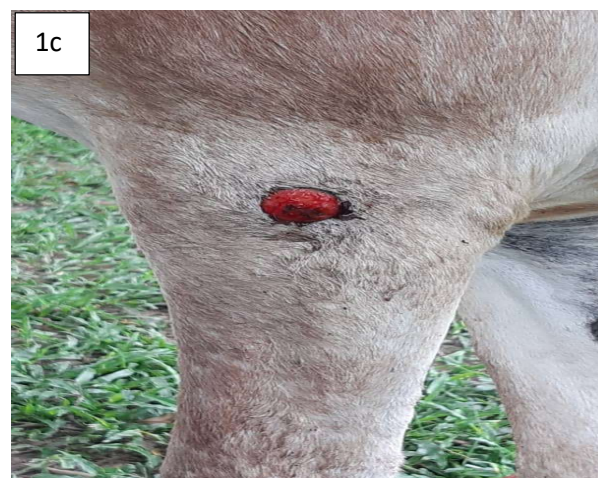
Fig 1c: swollen mass around the left elbow joint.