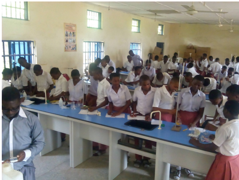
Fig. 3: A Typical Class Setting

The researcher adopted a quasi-experimental design for this study. the population consist of the entire senior secondary are in Calabar Education Zone, Cross River State.